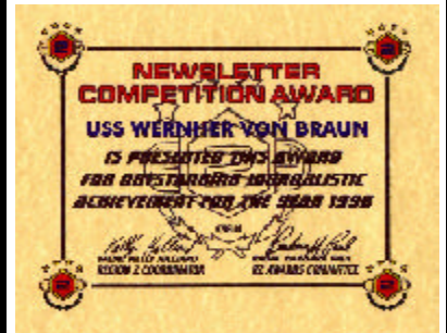
Awards that the von Braun has won over the years.