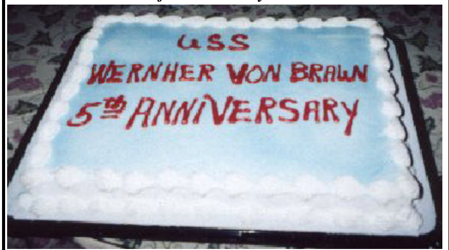
The Fifth Anniversary cake.