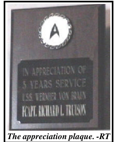
The appreciation plaque. -RT